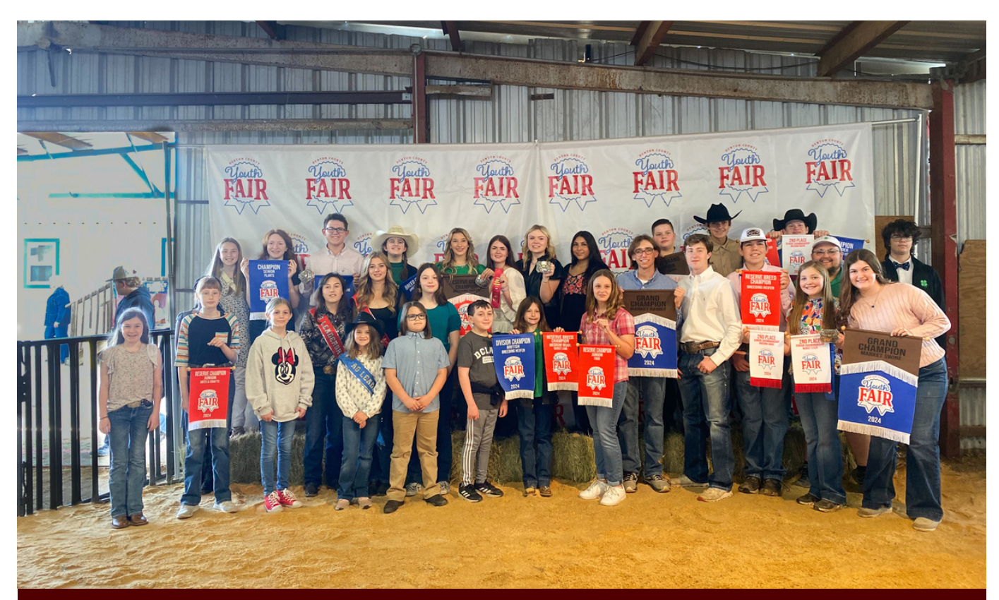
Our 4-H members proudly presenting their many awards at the Denton County Youth Fair!

Overall, it was a rewarding experience for all involved, highlighting the vibrant agricultural community and the future leaders it fosters within Denton County. Denton County 4-H members were amongst the best of the best, receiving many top honors. Pictured below are a few of our 4-H members showcasing their banners and buckles that they brought home!