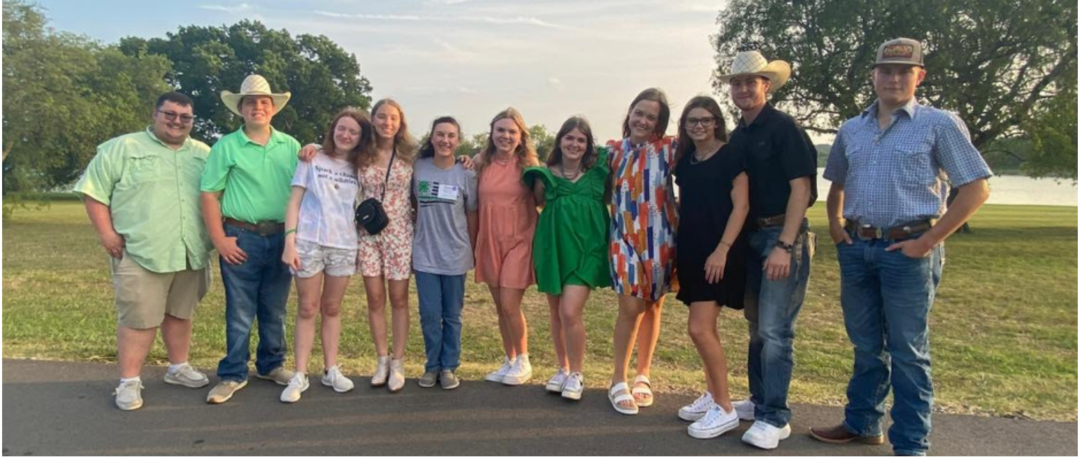
2023 DENTON COUNTY ULTRA LEADERSHIP LAB PARTICIPANTS