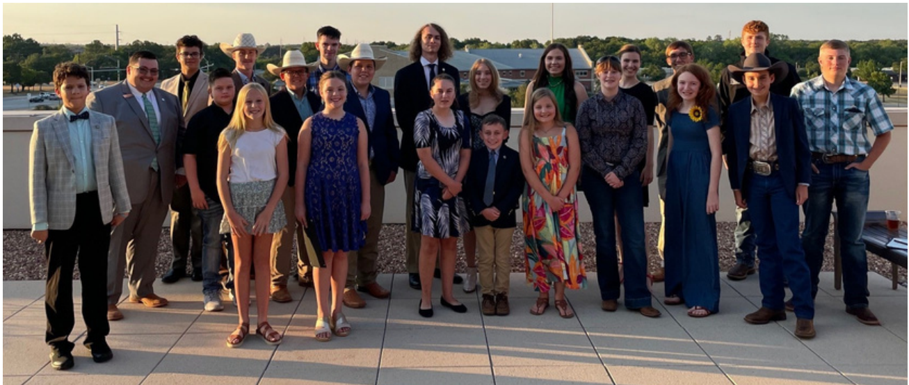
2022 Gold Star Banquet Award Winners

This award is to recognize an individual that shows a strong commitment to their club and is very active in all of the clubs activities. This individual may not be the loudest in the room or the center of attention but the club would not be the same without them.