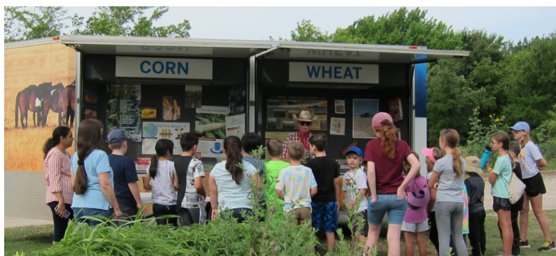
Left: Farm to Table Camp last summer

Interested in helping out with either event? Contact the office!