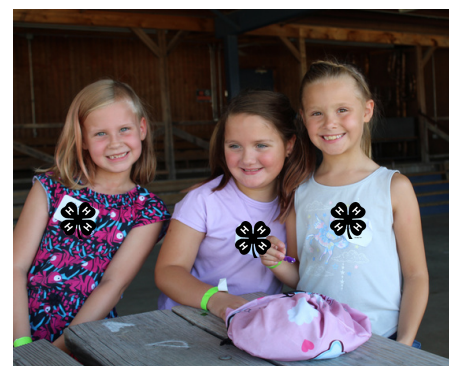
Right: Clover Kids Camp last summer.