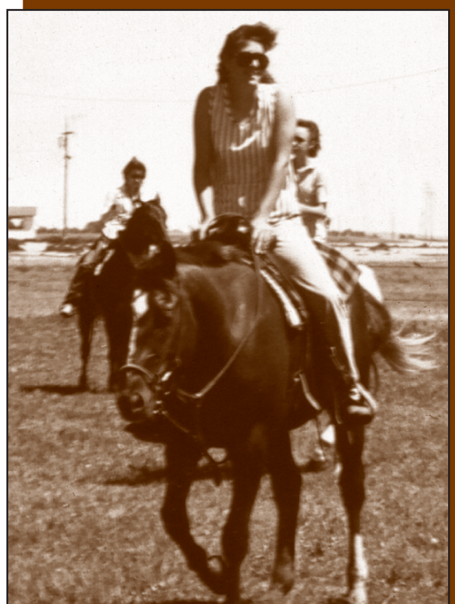
Regular exercise helps keep older horses active and useful.

For all riding horses (but especially for older ones), owners should plan ahead, paying close attention every day to exercise needs. Although it is convenient, quick and easy to jump on a four-wheeler to go to the mailbox or check a fence line, think of using your horses. A horse that will be needed to work cattle in a couple of months needs routine ex-