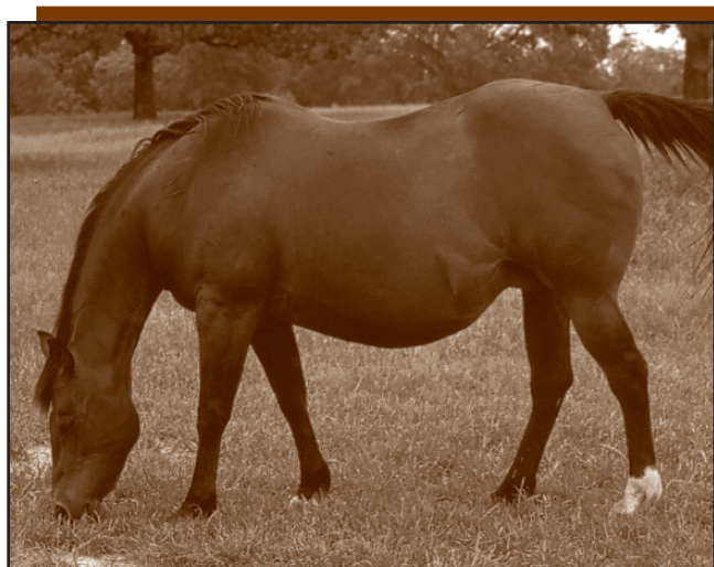
Broodmares should be fat, but not obese in body condition of 6-1/2 to 7.

Texas is home to some of the best broodmares in the country, but many owners worry about their mares 15 years old and older. Research including groups of older mares has focused on conception and foaling rates, in which body condition plays a significant role regardless of age. 13 Contrary to popular belief, fat mares have not experienced foaling problems (dystocia). 14 A group of older mares with no breeding-problem history should have conception rates of 95 percent or higher, provided they are in good body condition.