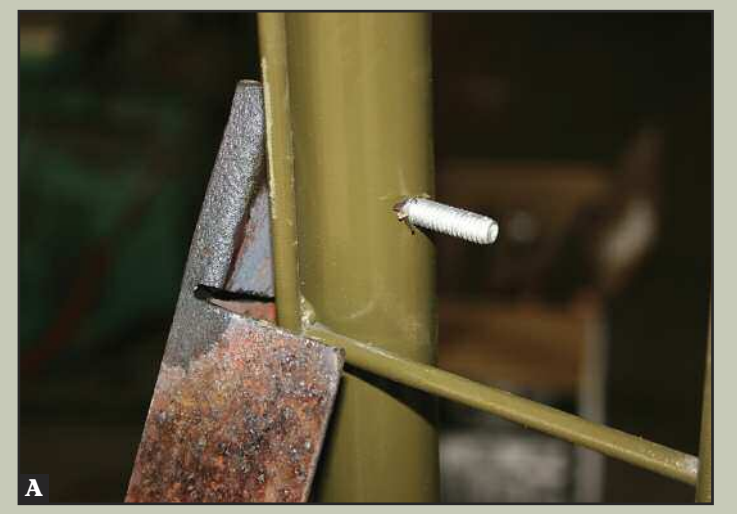
A bolt attaches the bracket to the door frame (A). Once attached, rope or chain provides support to the bracket (B).