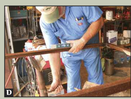
A piece of angle iron marked for cutting (A). After cutting (B and C), the iron can be heated and bent to form the desired configuration (D). The bracket is then welded. Designs may differ, depending on the door style.

For best results, the rooter/lifter door can be modified so that it initially functions as a drop door. After the first group of hogs is captured, the door then functions as a rooter/lifter door, allowing others to push their way into the trap.