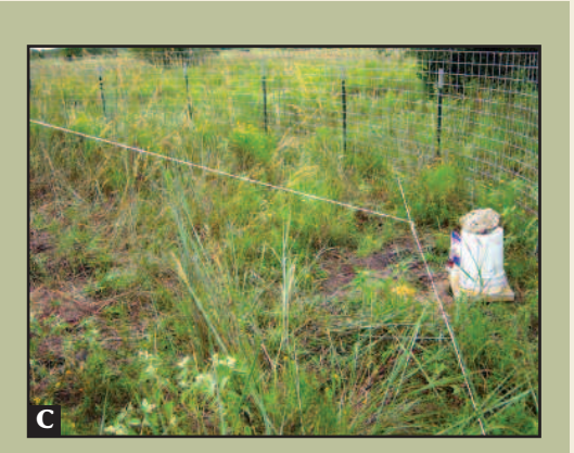
A board is used as a prop on a swing gate (A). T-posts guide the wire from the prop to the back of the trap (B). The wire is then attached to another wire forming a T-intersection at the trigger point (C). As the hogs feed on the bait, the wire is stretched, and the prop pulls from the gate.