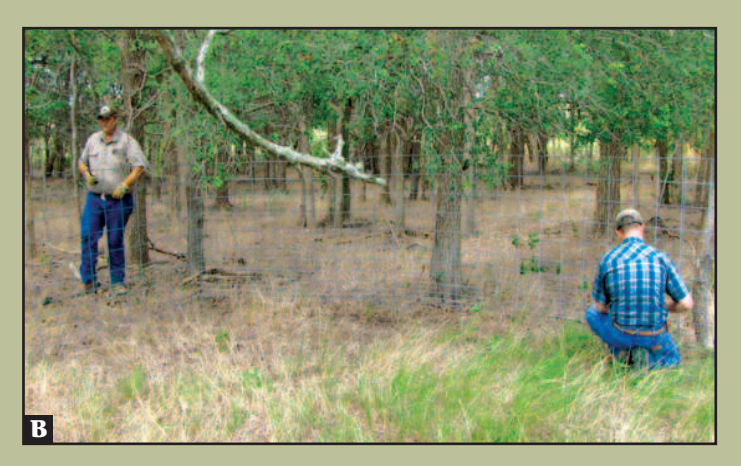
An extra pair of hands is helpful when attaching panels. One person holds the panels in place while the other secures them (A). After all the panels are secured, pull them to their desired location (B) to form a circle or teardrop shape.

with saloon-type gates, drop gates, or lifting rooter gates (Fig. 8).