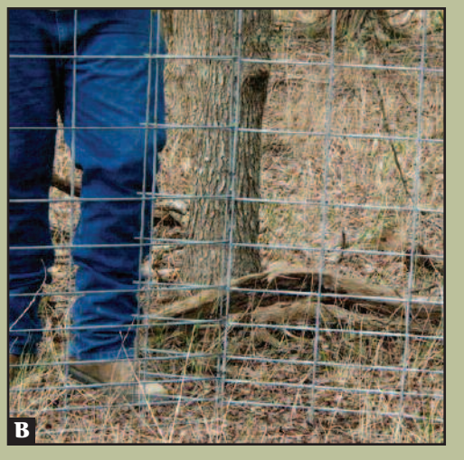
A panel secured to a head gate T-post with doubled wire (A). The remaining panels are atached to one another. It is important to overlap the ends of the panels (B).