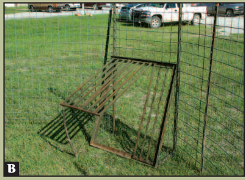
Swing gates require springs for closing (A). Lifting doors can be set in an open position like a drop gate, and once triggered, more hogs can push their way inside the trap (B). After triggering, the gate will close but permit more hogs to enter.