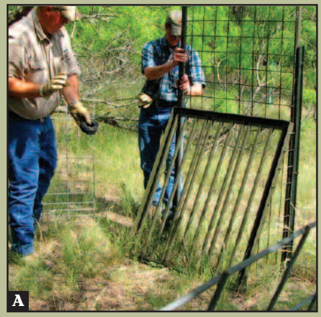
Use steel T-posts to secure a head gate (A). Make sure the head gate fits snugly against the T-posts using a doubled strand of baling wire (B).